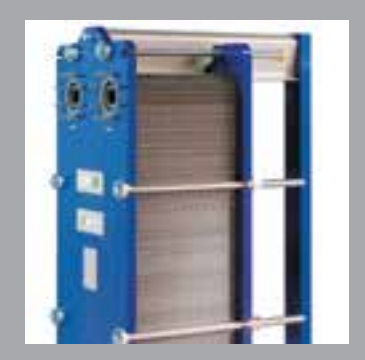
Plate Heat Exchanger