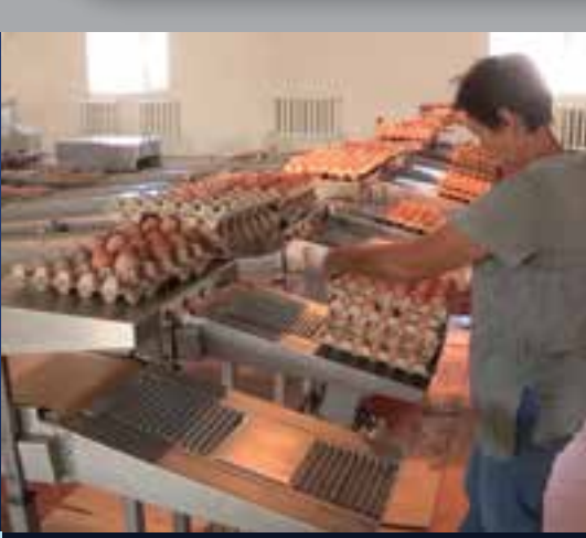
T00 Shymkent Kus