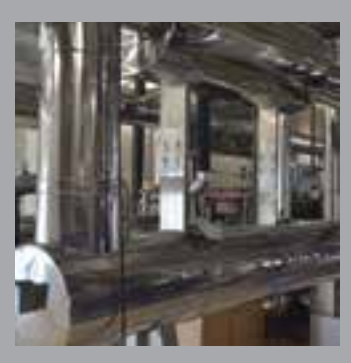
Exhaust Heat Boiler