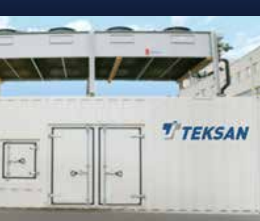
T.P.A.O. Silivri / Istanbul