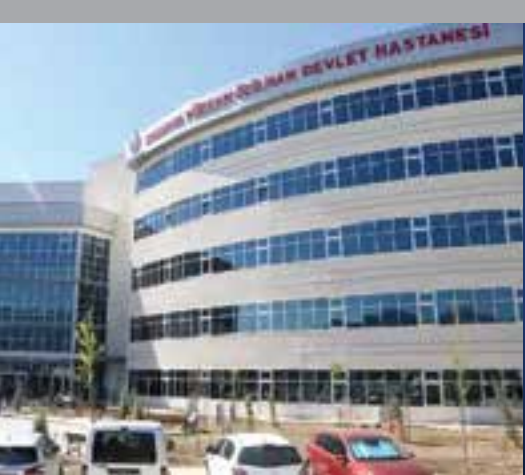
Izmir Bornova State Hospital / Izmir