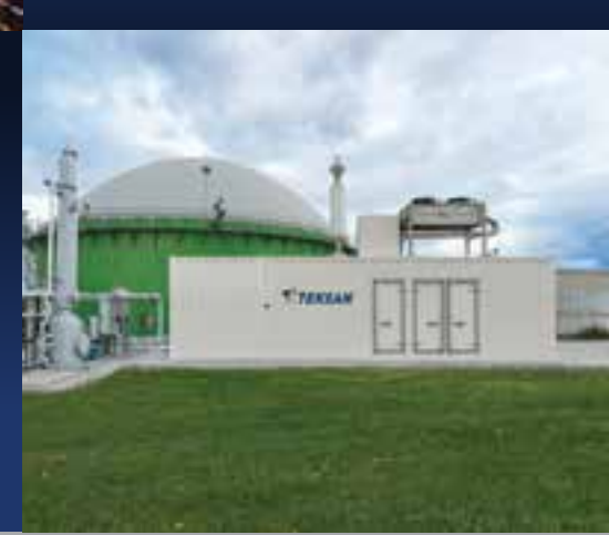
2 x 400 kW